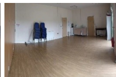
View of the Kitchenette (Rear Hall)

Returnable deposit Children's Parties up to 13years of age there is a returnable deposit of £50 Parties from 6pm onwards the returnable deposit of £100 (no alcohol) or £150 (alcohol) Deposits are required with 48hrs of booking your party date. This is non-refundable if the function is cancelled within 2 weeks of the booked date. 10% of the deposit is retained if cancelled with more than 2 weeks notice. We also hire out a sound system and projector if required. Between the ages of 14th to 21 st special conditions. (Sorry we no longer catering for 16th birthday parties) Please ask for details.