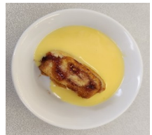
Jam Roly Poly

Our lunch club has grown though some days are busier than others. You must book your meal in advance as only the booked numbers of meals will be cooked. All meals are cooked fresh on the day. Sometimes we have to have a cut off point regarding the number of booked meals to the amount of food we have for the meals. This may only happen on occasions and its just a warning if we say we are unable to book you in.