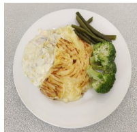
Fish pie & Veg