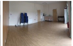
View of the Kitchenette (Rear Hall)

Returnable deposit Children's Parties up to 15years of age there is a returnable deposit of £50